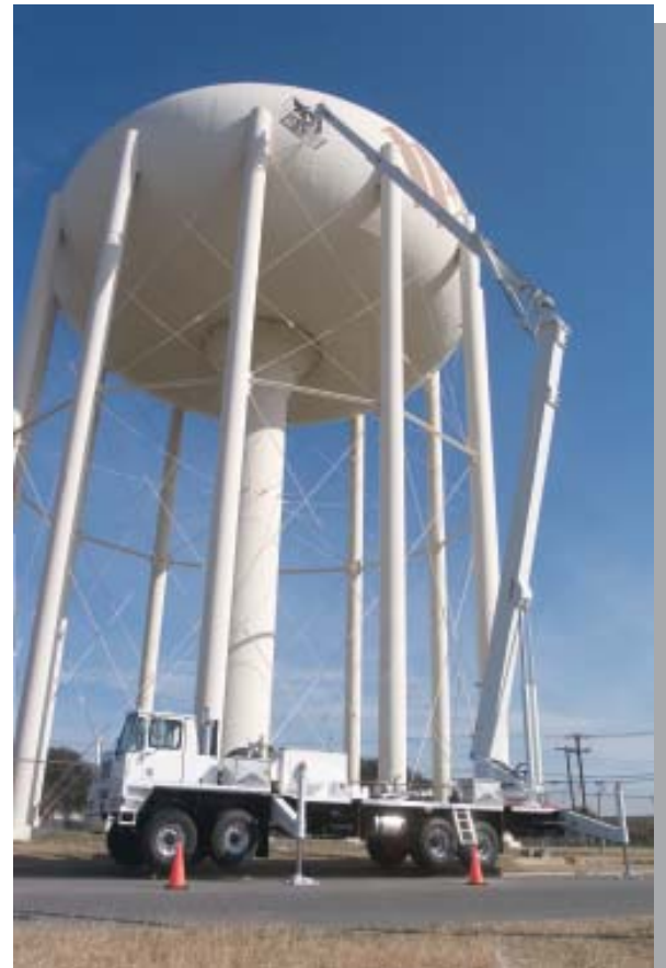
Offering 150 feet of Working Height