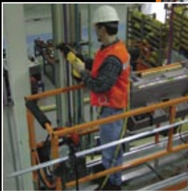
Application-Specific Tools to Do Your Best Work