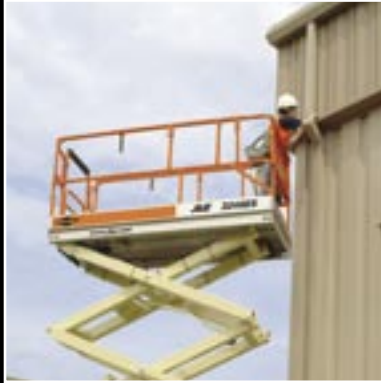
Longer Duty Cycles Keep You On the Job Longer