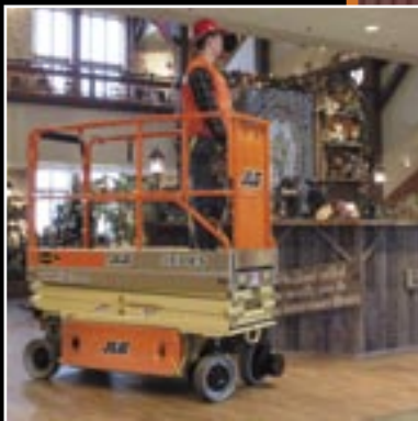
Quieter, Cleaner Operation for Indoor Work Areas